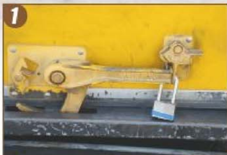
1 Trust your valuable cargo to this? Cut the shackle, pick the cylinder, shim the shackle, cut the arm... all very easy and not very loud.

Pacific Lock's new product announcement for the "Truck Puck Locking System" or "TPLS" is revolutionary and solves the age long dilemma of convenient and transferable high security at an affordable price. It is a two-piece, easy to use, very difficult to defeat, $129 security solution that will give you the peace of mind you're looking for. Based around a "hockey-puck" locking padlock, the TPLS has an extremely limited range of vulnerabilities. Locksmiths know