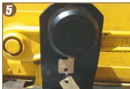
5 The cylinder is operated from the bottom making any attempts to pick this lock open very, very challenging.