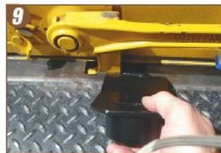
9 First step, hook the bottom of the TPLS into the groove in your truck bed.