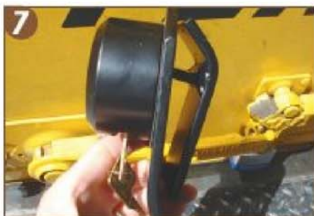
7 Both pieces of the TPLS locked together.