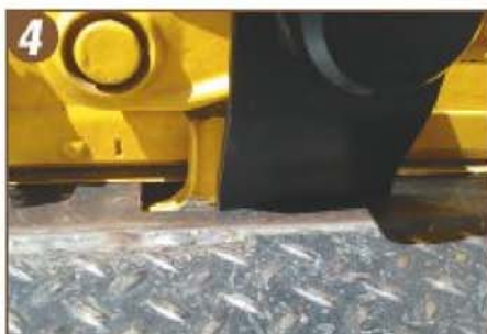
4 The TPLS even adds a layer of protection for your arm hook!