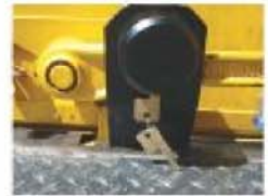
Made in USA from US and Foreign Components!

The only truly portable, high-security locking solution for Whiting roll-up truck doors! Todco version available soon!