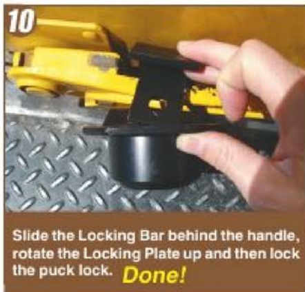
Slide the Locking Bar behind the handle, rotate the Locking Plate up and then lock the puck lock. Done!

You end up with a locking solution that forms an extremely solid bond between your truck bed (which is very hard for an attacker to go after) and the hinged area on your latching handle (again, a very hard area for an attacker to go after). No