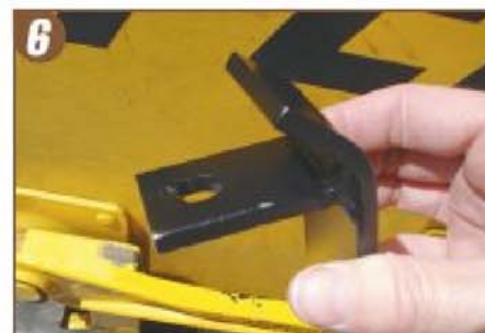
6 This piece slides behind your locking handle and locks into the Locking Plate.