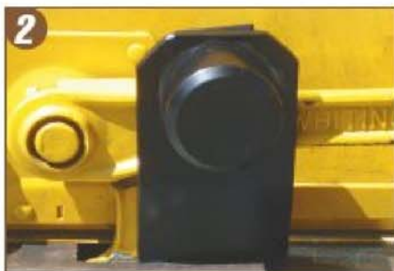
2 The newest, toughest, most affordable, and easiest to use roll-up trailer door locking solution in action!