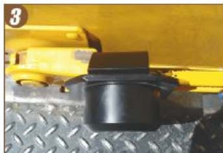
3 Even from the top, there is very little leverage or opportunity to grind or attack the TPLS!