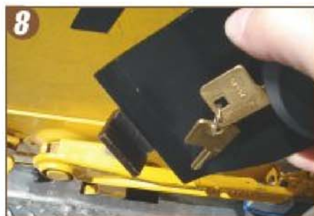
8 This is the tongue that secures against your truck bed.